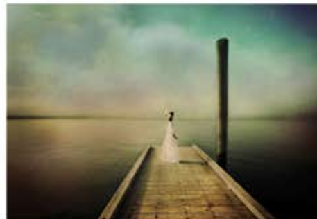
"Cross Points" Masterpiece Award - Illustrative