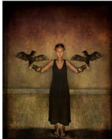
"Black Birds" Best of Show ASP Award Best Client Image Kodak Gallery - Illustrative Court of Honor - Illustrative