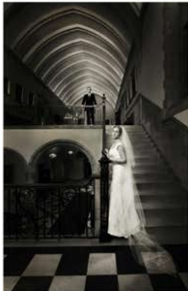
"Wedding Hall" Kodak Gallery - Wedding Court of Honor - Wedding