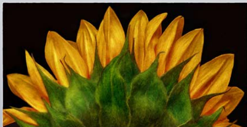
2013 MPPA Best of Show - "Ode to Summer" Thomas Fallon

The Inn at Brunswick Station 4 Noble St, Brunswick, ME 207-837-6565