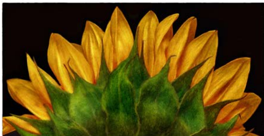
"Ode To Summer"

Masterpiece Award - Commercial/Industrial Court of Honor - Commercial/Industrial