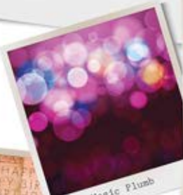
Bokeh Magic Plumb