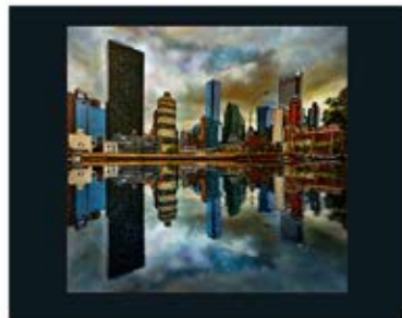
Tim Byrne "Let's Color the Town" Masterpiece Award - Electronic Imaging